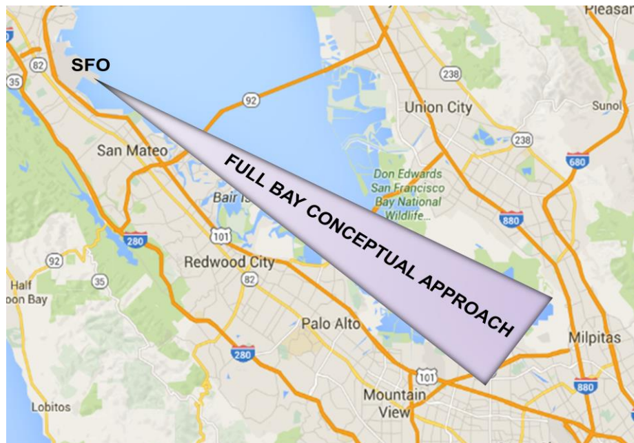
Figure 3 – Full-Bay conceptual approach over the Bay.